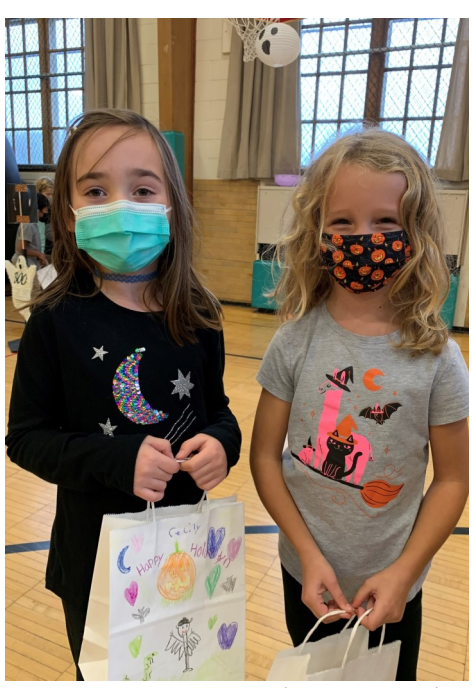
Monster Bash 2021!